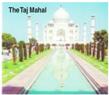
The Taj Mahal.